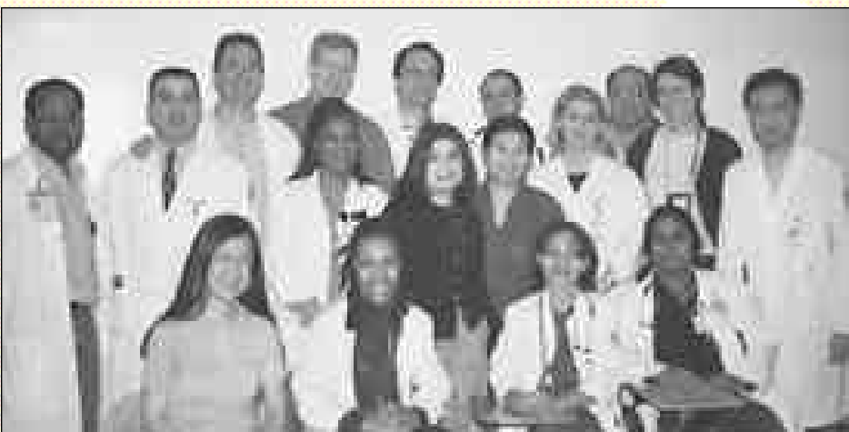
Cook County Hospital Residents for 2002

“When institutional racism was more obviously practiced, CCH played a major role in the lives of African Americans,” she says. “Some can now go to other hospitals, but they continue to frequent CCH due to its tradition of service.” ♦