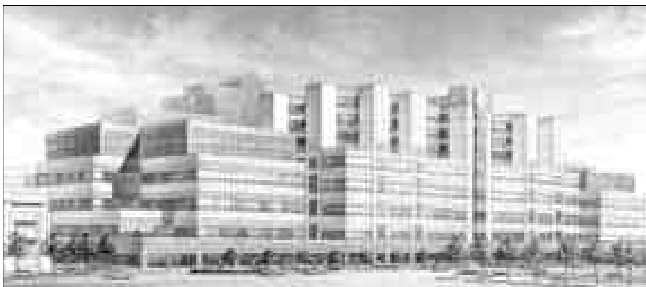
Cook County Hospital Department of Family and Community Medicine

Real life isn't usually like the movies or TV for that matter, but in the case of the TV show "ER", the producers are attempting to recreate real-life hospital scenarios. The show is based on Cook County Hospital in Chicago (CCH). CCH is also the home of the Hospital Crisis Intervention Project or HCIP.